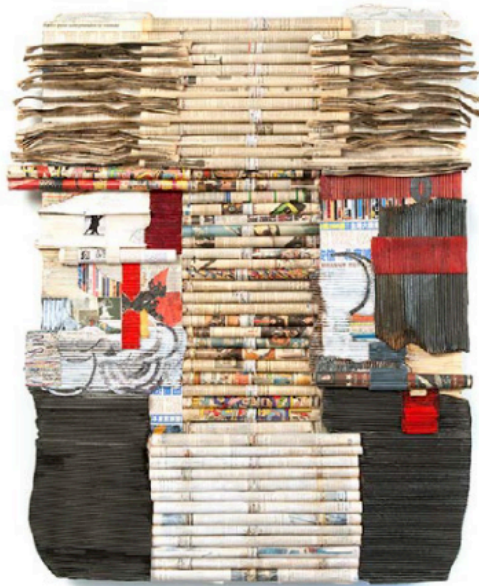
Message Machine rolled international newspapers, corrugated paper, handmade paper, graphite and paint 50" x 60"

She is the recipient of several residencies, awards and honors including a grant from the New York State Council on the Arts, and residencies at YADDO Foundation, Saratoga Springs, NY; the Virginia Center for the Creative Arts, Sweet Briar, VA; Women's Studio Workshop, Rosendale, NY, Awagami Paper International in Tokushima, Japan, and Conversations In Contemporaneity a residency in Otronto, Italy.